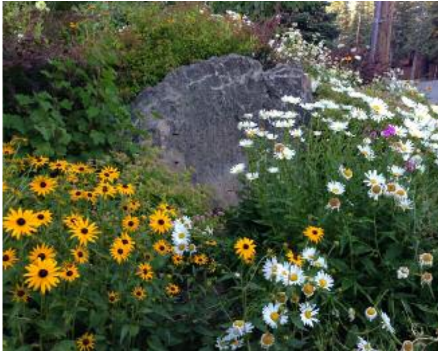
A plethora of blanket flowers and daisies adorn the autumn landscape.

"Delicious autumn! My very soul is wedded to it, and if I were a bird I would fly about the earth seeking the successive autumns." – George Elliot